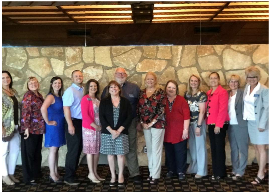
New 2019-2020 Board