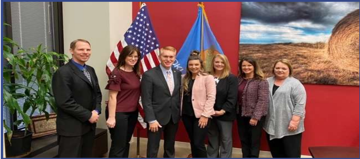
Above: OKAHU and TAHU members meeting with Senator James Lankford during the 2020 Capitol Conference