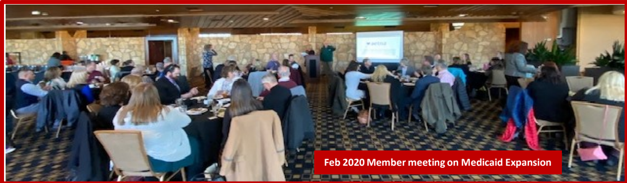
Feb 2020 Member meeting on Medicaid Expansion