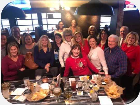
December 2019 Member Social