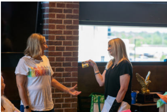
Pictures featuring board members at our recent induction at Chicken 'n' Pickle.