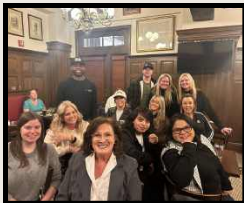
TULSA AND OKC GROUP PICTURE - DC