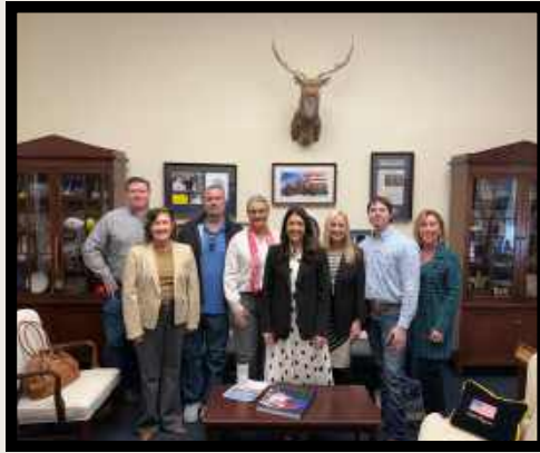
STEPHANIE BICE'S OFFICE