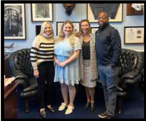
U.S. CAPITOL BUILDING