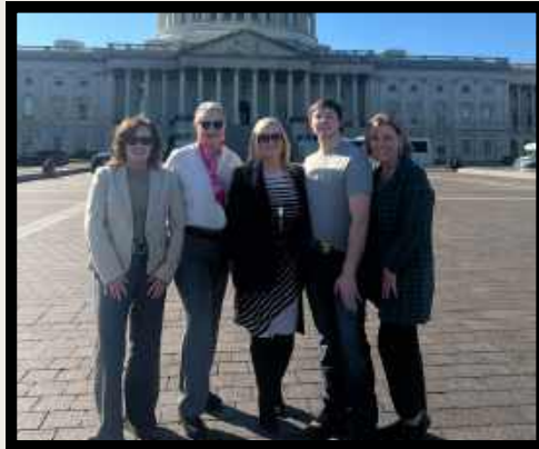
U.S. CAPITOL BUILDING