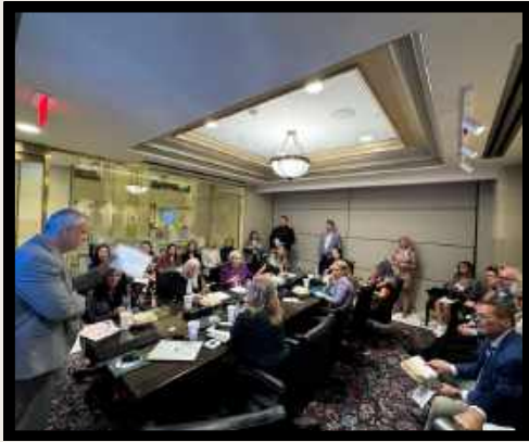
DAY AT THE CAPITOL - OKC

HERE ARE SOME IMAGES FROM OUR CHAPTER RECENTLY!