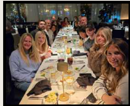
OKLAHOMA DINNER NIGHT - DC